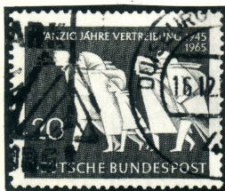
West German stamp remembering the refugees created by World War II.

Slogan handstamp used to deface inadmissible "W.R.Y." stamps.