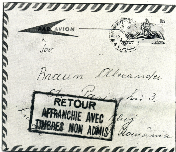
Cover with a stamp issued by Israel, denoting the "World Refugee Year".